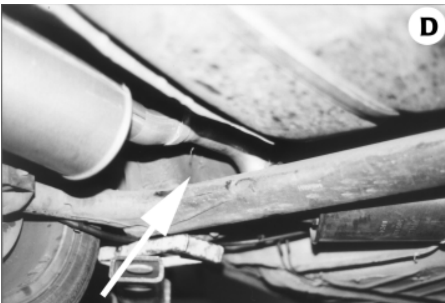
Figure D Shows the over-axle pipe again, this time with the muffler attached. The arrow is pointing out the gap between the pipe and the axle beam.