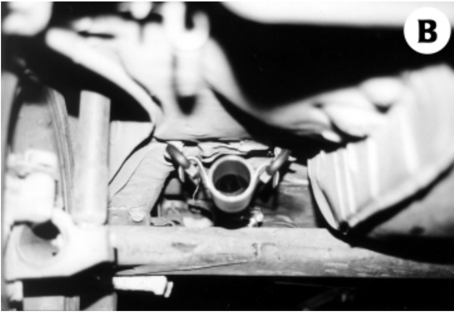
Figure B shows a rear view at the over-axle pipe, the way it should be hung, and the space between the axle and the pipe.