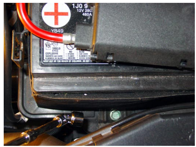
2. Remove battery stay