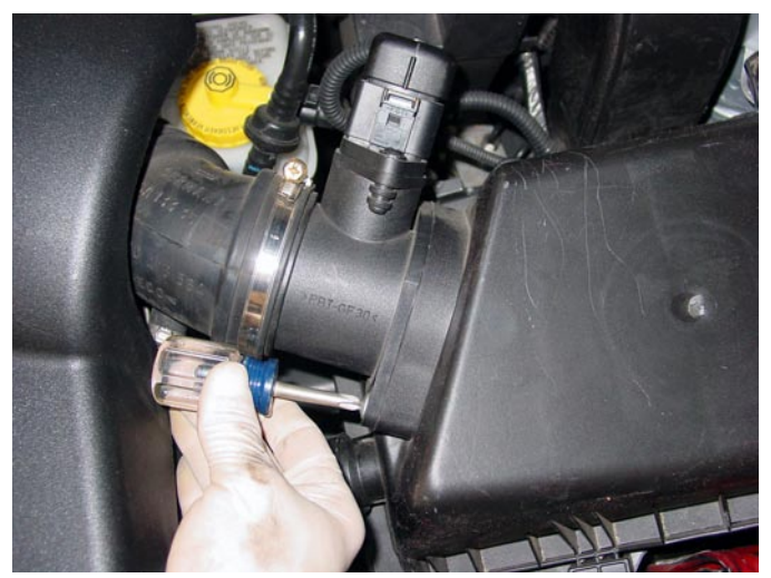
9.... remove the mass air meter.