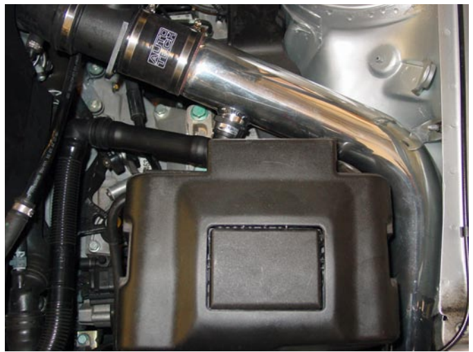
26. Install breather tube connector