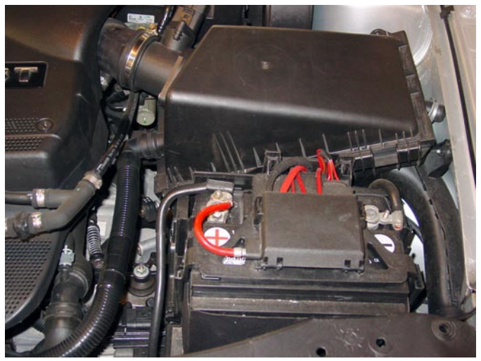
1. Remove battery cover