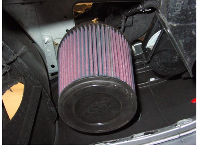
20. Install the air filter from underneath