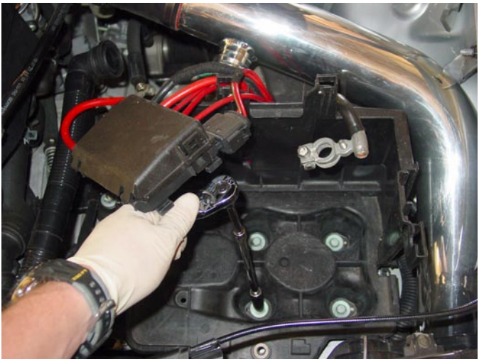
21. Re-install the battery tray