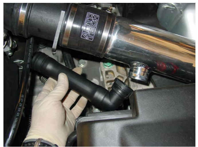
26. Install breather tube connector