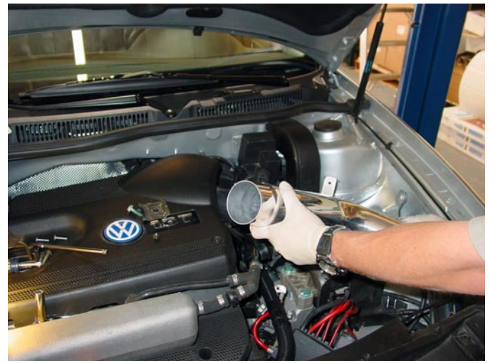
17. Install air inlet tube