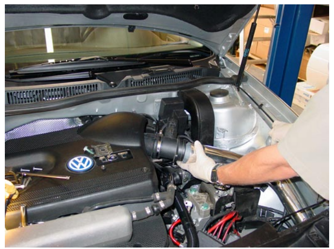
18. Install silicone hose ...