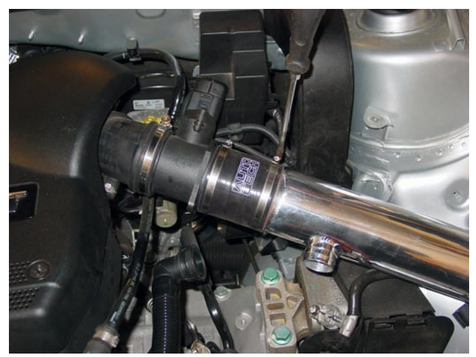
... And tighten clamps