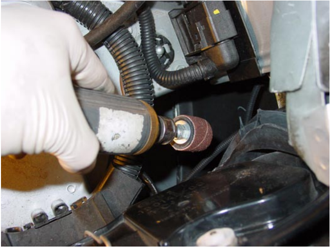
16....clearance rear of the headlight frame