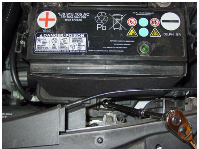
24. Re-attach the battery hold down