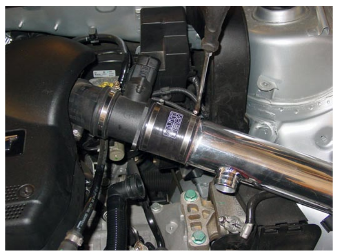
19. Install the nut on the flange of the tube