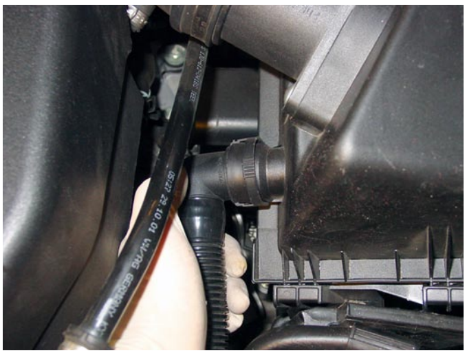
10. Disconnect breather hose