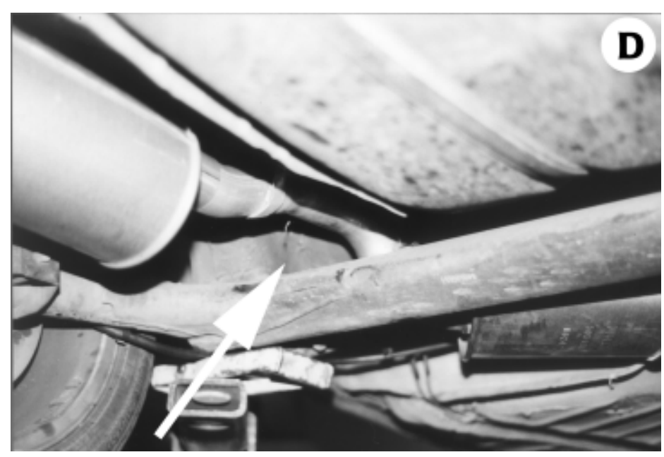
Figure D Shows the over-axle pipe again, this time with the muffler attached. The arrow is pointing out the gap between the pipe and the axlebeam.