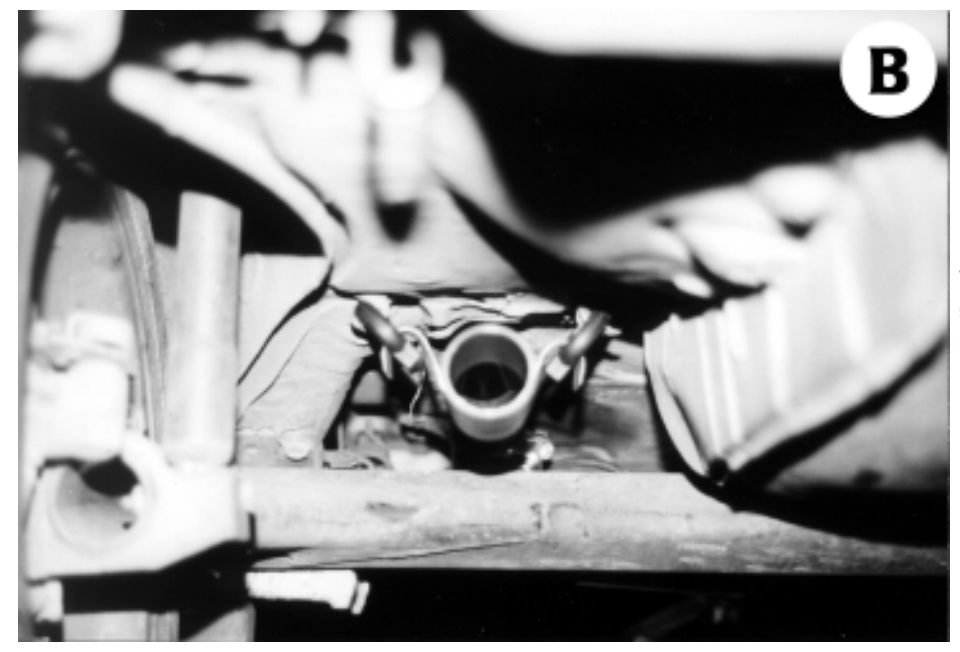
Figure B shows a rear view at the over-axle pipe, the way it should be hung, and the space between the axle and the pipe.