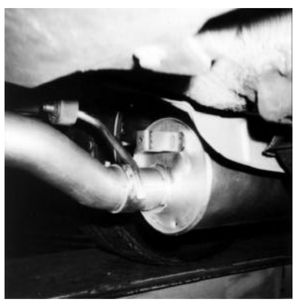
Fig 3. Right side view of clamp/hanger installed at back of rear muffler.

Fig 1. Right side view of midpipe hanger (a) and clamp installed. The supplied rubber hanger (b) bolts to the car in place of the dual hanger assembly found on 1993-95 vehicles. Hook in foreground is not used on the A3.