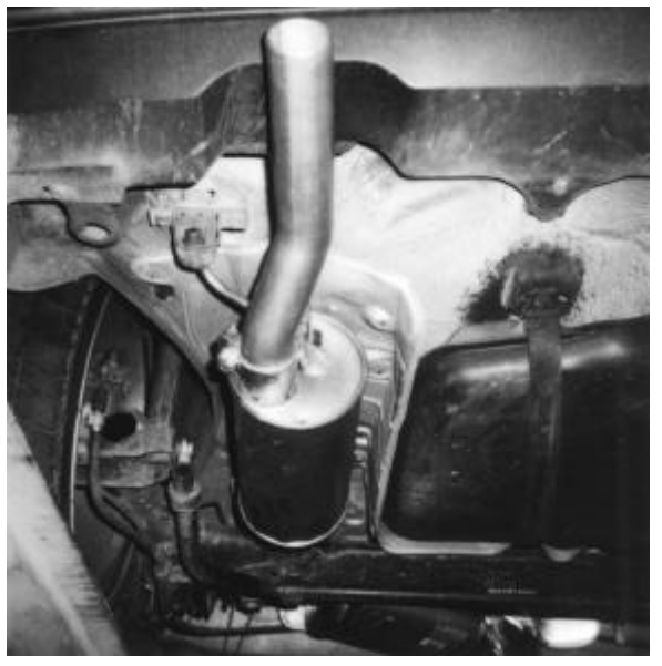
Fig 4. Rear view of rear muffler and tailpipe assembly on a Golf 3. Note the position of the drain hole on the back plate of the muffler. This shows the rotation of the rear muffler for best fitment.