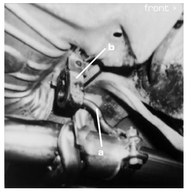
Fig 1. Right side view of midpipe hanger (a) and clamp installed. The supplied rubber hanger (b) bolts to the car in place of the dual hanger assembly found on 1993-95 vehicles. Hook in foreground is not used on the A3.