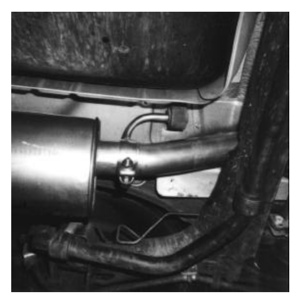
Fig 2. Right side view of clamp/hanger installed at front of rear muffler.