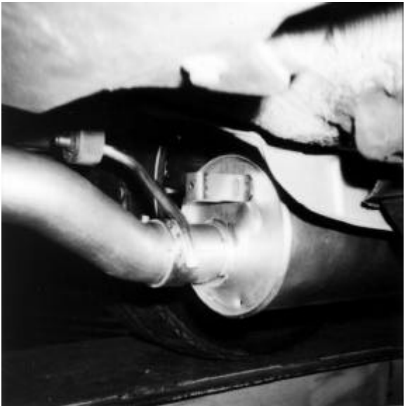
Fig 3. Right side view of clamp/hanger installed at back of rear muffler.