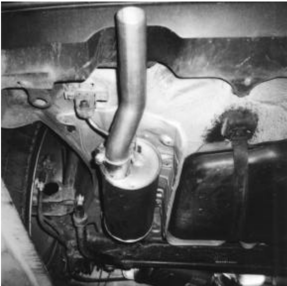
Fig 4. Rear view of rear muffler and tailpipe assembly on a Golf 3. Note the position of the drain hole on the back plate of the muffler. This shows the rotation of the rear muffler for best fitment.