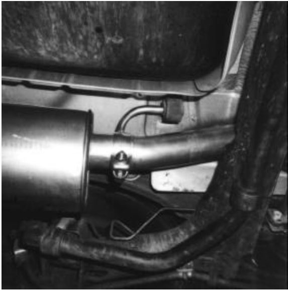
Fig 2. Right side view of clamp/hanger installed at front of rear muffler.