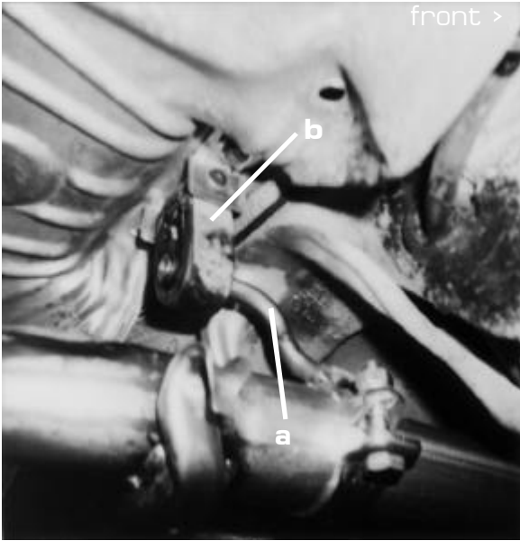
Fig 1. Right side view of midpipe hanger (a) and clamp installed. The supplied rubber hanger (b) bolts to the car in place of the dual hanger assembly found on 1993-95 vehicles. Hook in foreground is not used on the A3.