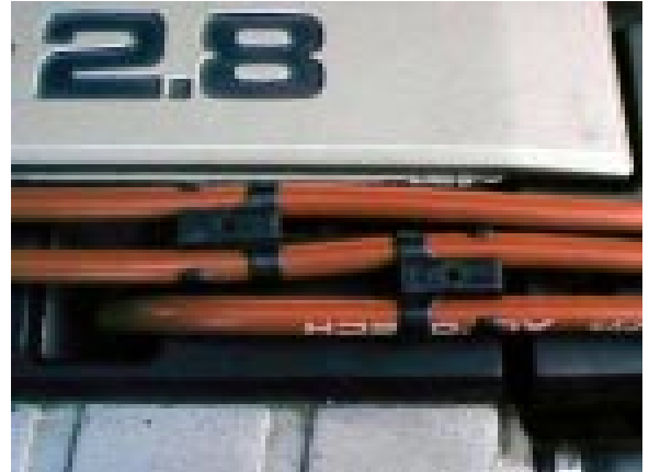
Close-up view of front bank clip positions.