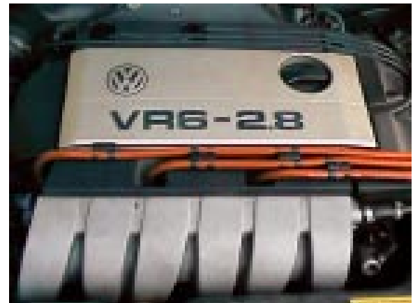
Completed front bank installation