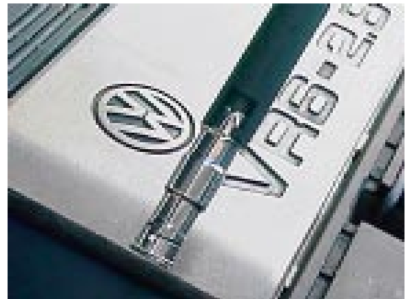
Plug wire tool engaged on connector end.